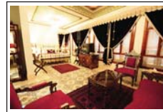
Midhat Pasha Large Bed 35 m 2