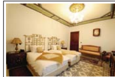
Ahmad Ezzat Pasha Abed Twin Bed 28 m 2