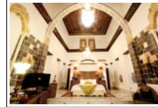
Assaad Pasha Azem Large Bed 41 m 2